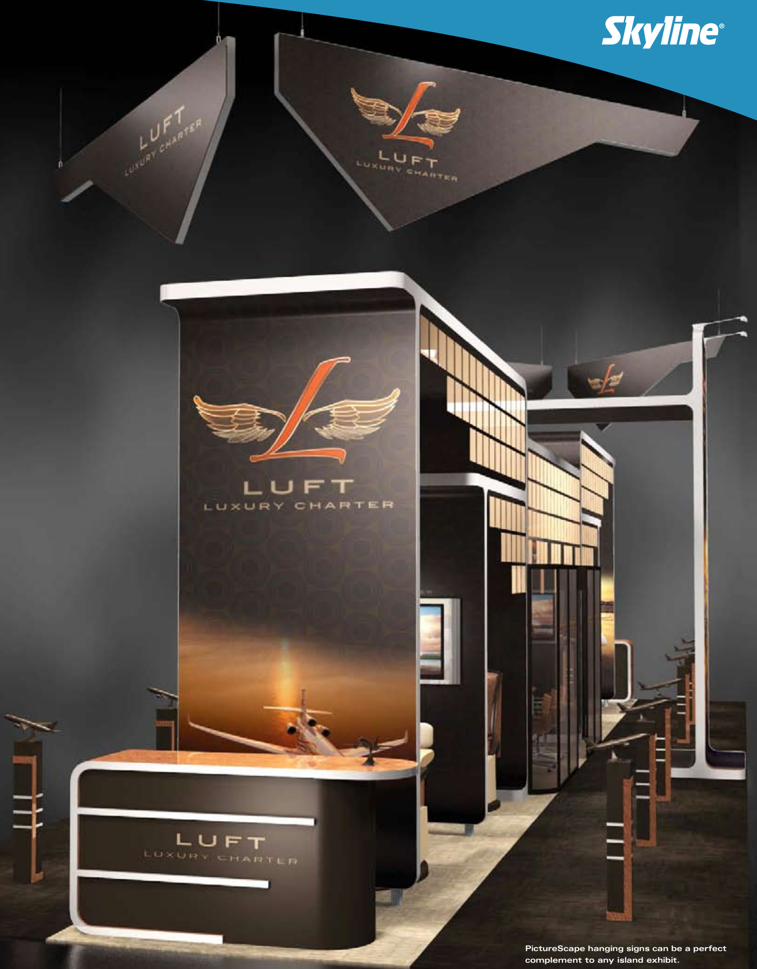
PictureScape hanging signs can be a perfect complement to any island exhibit.