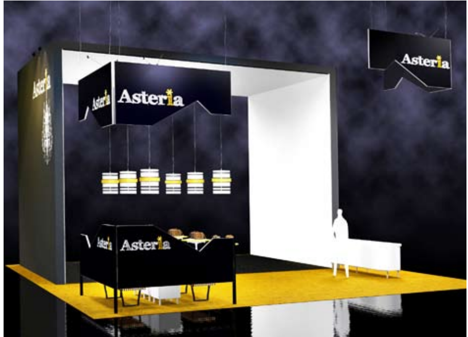
Custom shapes, and the use of positive and negative space, can create interesting areas without adding significant bulk and weight. Visually, PictureScape works with SkyTruss® structures (above) and other Skyline custom modular systems.

Exhibit infrequently? Rent your exhibit hardware now and leave future design possibilities open. Or rent additional components for a larger presence at your major show.